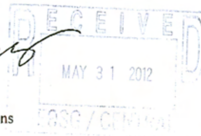
LI Baodong Ambassador and Permanent Representative of the People's Republic of China to the United Nations

I avail myself of this opportunity to renew to Your Excellency the assurances of my highest consideration.