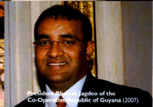
President Bharrat Jagdeo of the Co-Operative Republic of Guyana (2007)