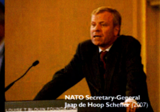
NATO Secretary-General Jaap de Hoop Scheffer (2007)