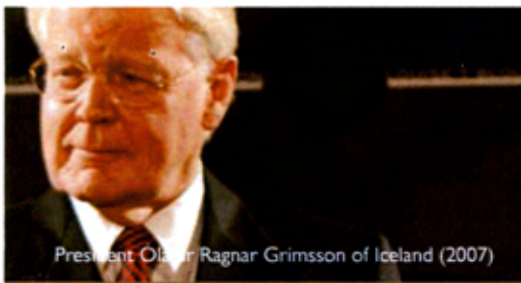
President Ólafur Ragnar Grímsson of Iceland (2007)