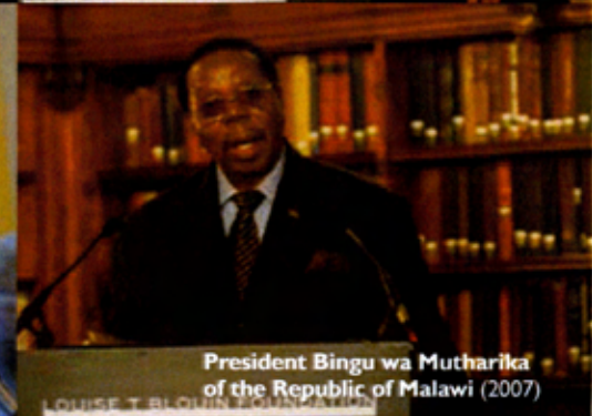
President Bingu wa Mutharika of the Republic of Malawi (2007)