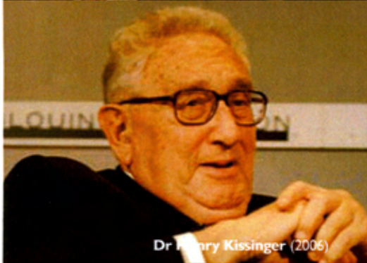
Dr Henry Kissinger (2006)