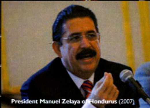
President Manuel Zelaya of Honduras (2007)