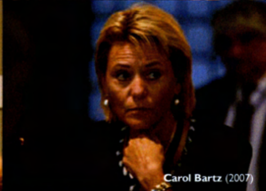
Carol Bartz (2007)