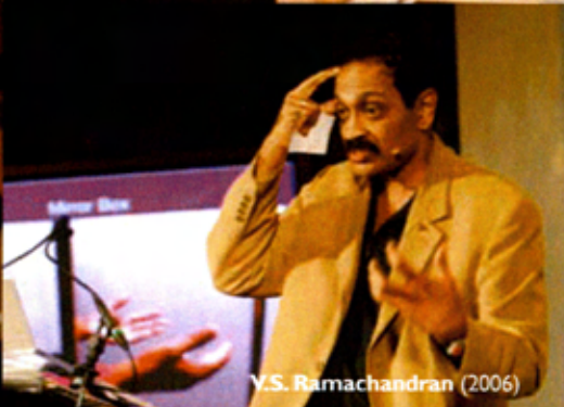
V.S. Ramachandran (2006)