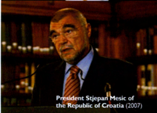
President Stjepan Mesic of the Republic of Croatia (2007)