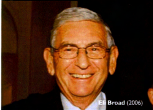
Eli Broad (2006)