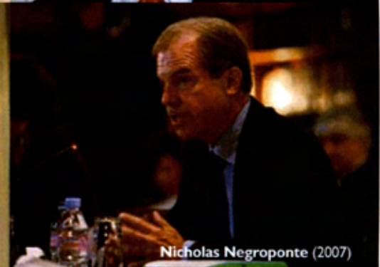
Nicholas Negroponte (2007)