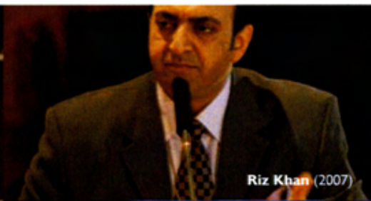
Riz Khan (2007)