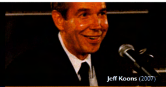
Jeff Koons (2007)