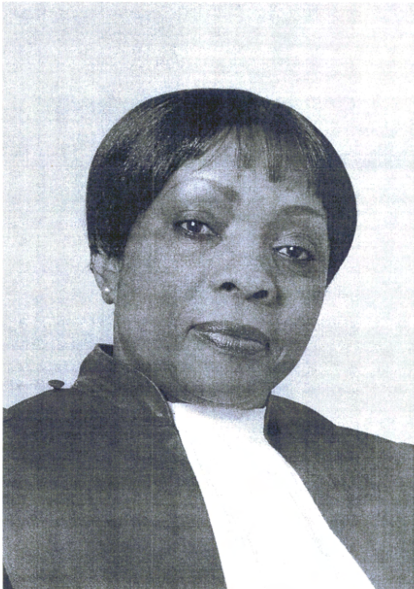
UGANDA CANDIDATE FOR THE POST OF JUDGE OF THE INTERNATIONAL COURT OF JUSTICE - ICJ, THE HAGUE