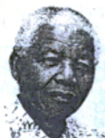
Nelson Mandela Nobel Peace L.