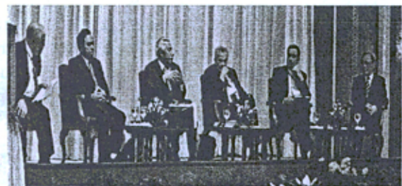
Panel Debate, “Strategic Tourism Industry Response to International Terrorism”