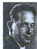
Dag Hammarskjöld Un Secretary General