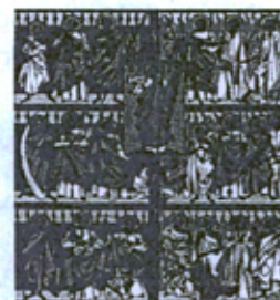
Stained glass windows at Martyr's trail Basilica