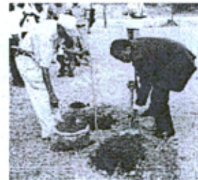
Dedication of IIPT Peace Park at Victoria Falls, Zambia