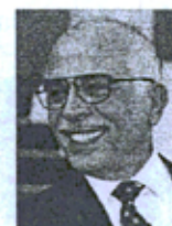
Al-Hussein bin Talal King of Jordan