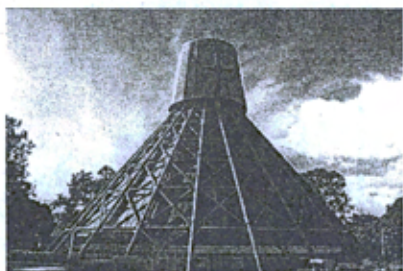
Martyr's Trail Basilica Namugongo - Uganda