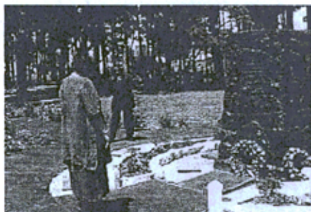
Swedish Ambassador places wreath Hammarhjold Memorial Site, Ndola