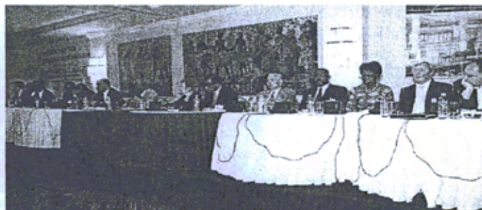
Members of Round Table in plenary session debating 21st Century Vision for African Tourism