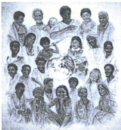
One Earth One Family

IIPT was born in 1986, the UN International Year of Peace, with a vision of Travel and Tourism becoming the world's first "Global Peace Industry" – an industry that promotes and supports the belief that every traveler is potentially an "Ambassador for Peace."