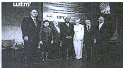
Announcement of 3 rd Global Summit Center Stage World Travel Market

More than 5,000 persons from some 120 countries have come together over the past 20 years to share their experiences, ideas, insights, wisdom and commitment to IIPT's vision of making travel and tourism the world's first "Global Peace Industry." Thousands more have been influenced by media coverage of the Conferences. Nearly 1,000 case studies of "Success Stories" and models of "Best Practice" have been presented demonstrating the "Higher Purpose" of Tourism and the social, economic, cultural, environmental, and political dimensions of tourism.