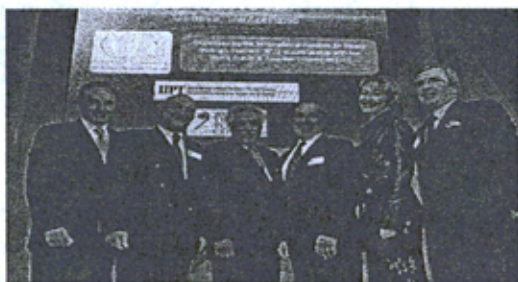
Announcement of 2 nd Global Summit Center Stage World Travel Market

have been held in Turkey, Greece, Italy, Israel, and Jordan; and IIPT Chapter conferences have been held in Australia, the Caribbean, and Pakistan.