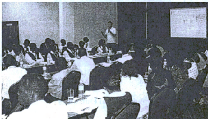
IIPT Student/Youth Leadership Forum – 4 th African Conference