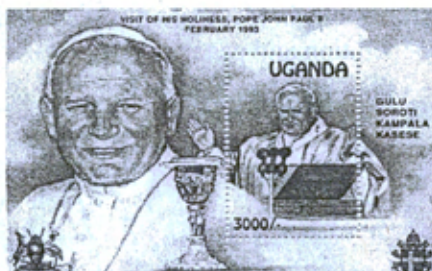
Stamp of Pope John Paul II in honor of his visit to Uganda