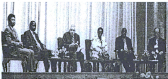
Panel Debate on Healing the Wounds of Conflict through Tourism, Culture & Sport