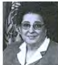
Thoraya Ahmed Obaid UN Population Fund (UNFPA)