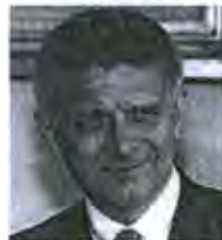
Marek Belka Economic Commission for Europe (ECE)