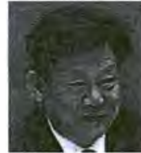
Sha Zukang Economic and Social Affairs

UN Human Settlements Programme (UN-HABITAT)