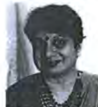
Radhika Coomaraswamy Children and Armed Conflict