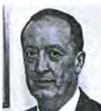
Antonio Maria Costa Director-General (UNOV), Executive Director (UNODC)