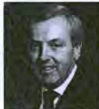
John Holmes Humanitarian Affairs and Emergency Relief Coordinator