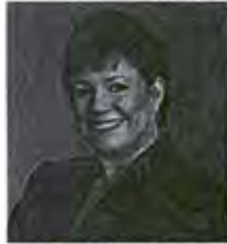
Ann M. Veneman UN Children's Fund (UNICEF)