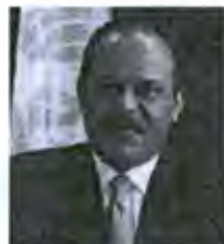
Bader Al-Dafa Economic & Social Commission for Western Asia (ESCWA)