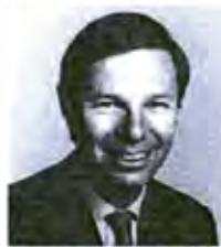
Jean-Marie Guéhenno Peacekeeping Operations