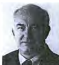
Kemal Dervis UN Development Programme (UNDP)