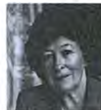
Louise Arbour High Commissioner for Human Rights (UNHCHR)