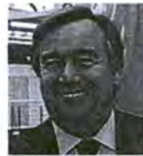
António Manuel de Oliveira Guterres UN Refugee Agency (UNHCR)