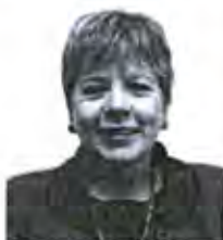
Alicia Bárcena Ibarra Management