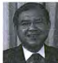
Supachai Panitchpakdi UN Conference on Trade and Development (UNCTAD)