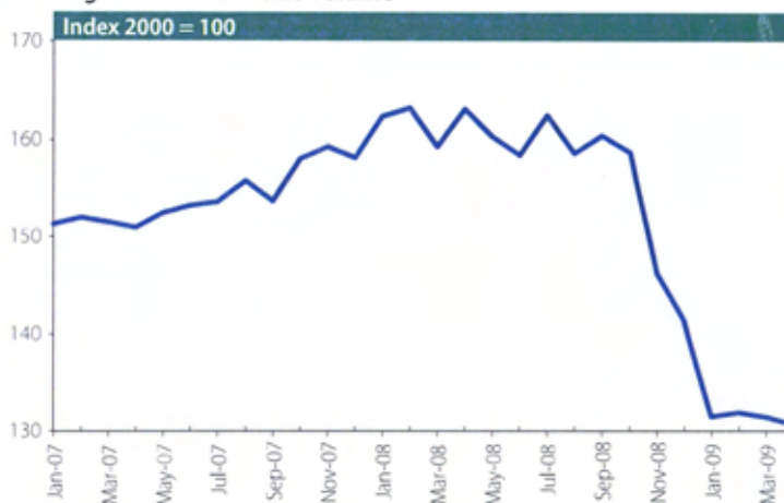
Figure 1: World Trade Volume