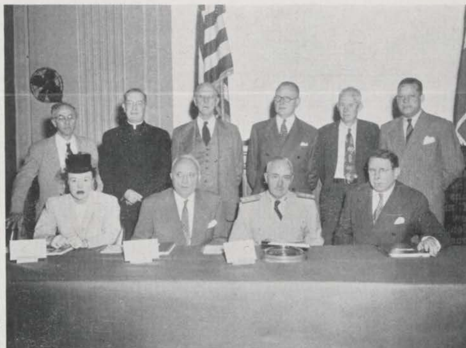
FEDERAL HOSPITAL COUNCIL MEETS (See Washington Round Up)