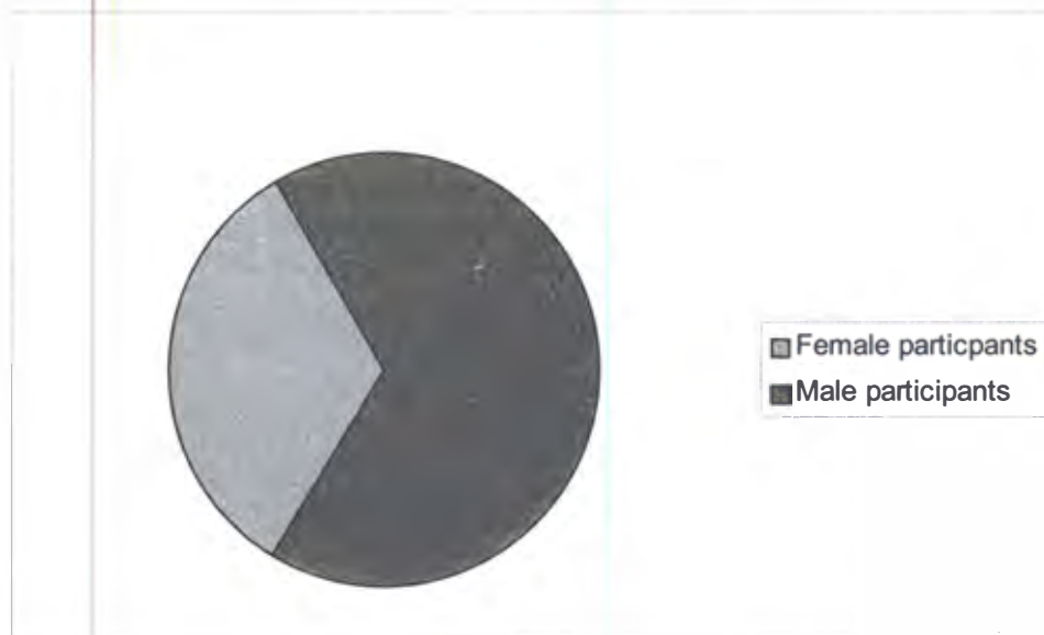
Figure 3 Gender ratio at UNIDIR meetings