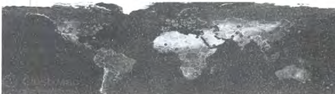
Figure 1 Distribution of interest in Disarmament Insight

As part of its outreach activities, UNIDIR has also developed its Web presence via social networking sites.