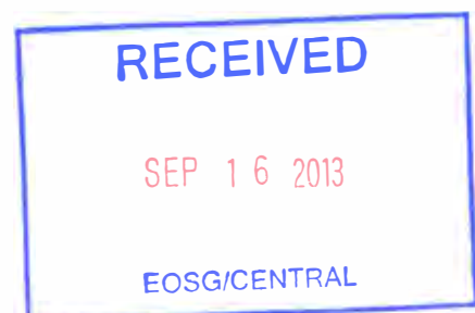
Hervé Ladsous 13 September 2013