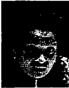
Ms. Geraldine FRASER-MOLEKETI (South Africa)

Ms. Fraser-Moleketi is currently a member of the Committee of Experts on Public Administration. She is the Minister for Public Service and Administration of South Africa (since June 1999). She previously served as Minister for Welfare and Population Development (1996-1999); Deputy Minister for Welfare and Population Development (1995-1996); and Co-Deputy Elections Coordinator of the National Elections Commission of the African National Congress (1993-1994). She has been a Member of Parliament from 1994 to date. She is a member of the National Executive Committee of the African National Congress of South Africa and a member of the Commonwealth Association of Public Administration and Management Board (CAPAM), as well as the Chairperson of the Innovation Committee of CAPAM. She was awarded a fellowship to Harvard University, Institute of Politics, Kennedy School of Government, which focused on policy analysis and investigated comparative aspects of national constitutions.