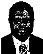
Mr. Peter ANYANG' NYONG'O (Kenya)

Mr. Anyang' Nyong'o was appointed the Minister of Planning and National Development of the Republic of Kenya in 2003. He specializes in the area of socio-economic and pro-poor policies. He has served as Member of the Parliament, Kisumu Rural Constituency, from 1992-1997 and presently for the term 2003-2007. He was also formerly the Chairman of the Public Investments Committee from 1994 to 1996. He previously served as Member of the Board of Directors of the Nelson Mandela Institute for the Advancement of Knowledge, Science and Technology. In 1995, he was given the German-African Award for his contribution to scholarship and democratization. This year, he received the Africa Brain Gain Award from the Kenyan American Professional Association and Career Nation for his contribution to reversing African's brain drain. He also served as the Head of Programmes for the African Academy of Science from 1987 to 1991.