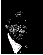
Dr. Luiz Carlos BRESSER-PEREIRA (Brazil)

Dr. Bresser-Pereira is currently a member of the Committee of Experts on Public Administration. He is currently a Professor of Economics at Getúlio Vargas Foundation in São Paulo, since 1959; President of the Centro de Economia Política and editor of the quarterly Brazilian Journal of Political Economy, since 1980; President of the Scientific Council of CLAD - Consejo Latinoamericano de Administración para el Desarrollo, since 1998; and Assistant to the President Fernando Henrique Cardoso for international affairs related to social democracy and progressive governance, since August 1999. He was Honorary Professor of the University of Buenos Aires, 1996; Visiting Professor at the École d'Hautes Etudes en Sciences Sociales, Paris, January-February, 1990 and September-October 1993; and Visiting Professor at the Institut du Développement Economique et Social (IEDES), University of Paris I (Sorbonne), September 1977 - February 1978. He was Minister of Science and Technology (Cardoso Administration), January - July 1999; Minister of Federal Administration and Reform of the State (Cardoso Administration), 1995-1998; and Finance Minister (Sarney Administration) 29 April to 18 December 1987.