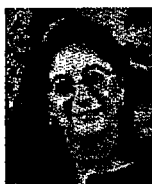
The Honourable Jocelyne BOURGON (Canada)

The Honourable Bourgon is currently a member of the Committee of Experts on Public Administration. She is the Ambassador, Canadian Permanent Mission to the OECD, and the President Emeritus of the Canadian Centre for Management Development. In 1989, she was appointed to the rank of Deputy Minister. From 1989 to 1994 she was, in turn, Deputy Minister of Consumer and Corporate Affairs, Secretary to the Cabinet for the Federal Provincial Relations Office, President of the Canadian International Development Agency, and Deputy Minister of Transport. In 1994, she was appointed Clerk of the Privy Council and Secretary to the Cabinet. She was the first woman to hold this position. She served as Clerk of the Privy Council, Secretary to the Cabinet and head of the Public Service of Canada from 1994 to 1999. In December 1998, she was summoned to the Queen's Privy Council for Canada in recognition of her contribution to the service of her country. She is an active member of various advisory boards, including the Commonwealth Association for Public Administration and Management (CAPAM), Singapore Civil Service College, Canadian Unity Council, Heart Institute (University of Ottawa), National Council on Leadership, Forum of Federations, the Public Executive Programme (Queen's University), University of Ottawa, and Opera Lyra Ottawa.