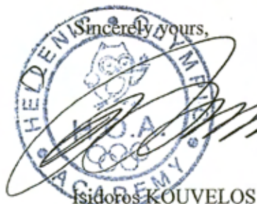
Isidoros KOUVELOS President of the Hellenic Olympic Academy