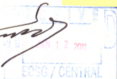
Ólafur Ragnar Grímsson