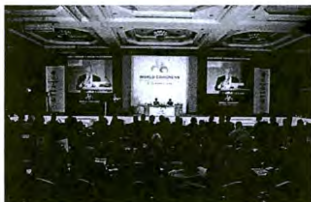
"Facing Challenges and Finding Solutions" March 22-24, 2008 - Istanbul, Turkey