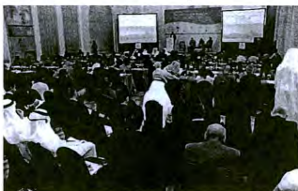
"Defining the Roadmap for the Next Decade" March 23-24, 2011 - Dubai, UAE