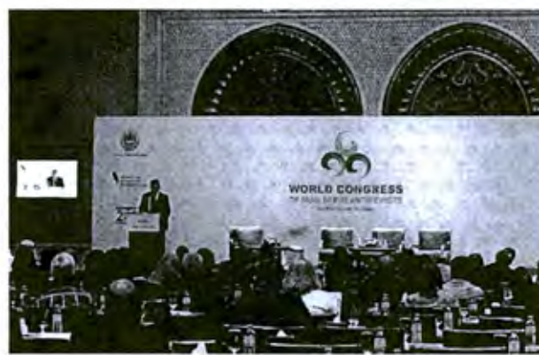
"Conventional to Strategic: A New Paradigm in Giving" March 22-23, 2009 - Abu Dhabi, UAE