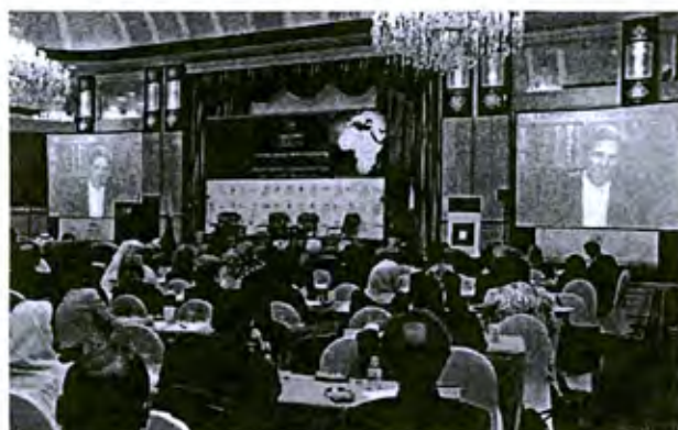
"Building a Better World New Horizons - Sound Strategies" March 21-22, 2010 - Doha, Qatar