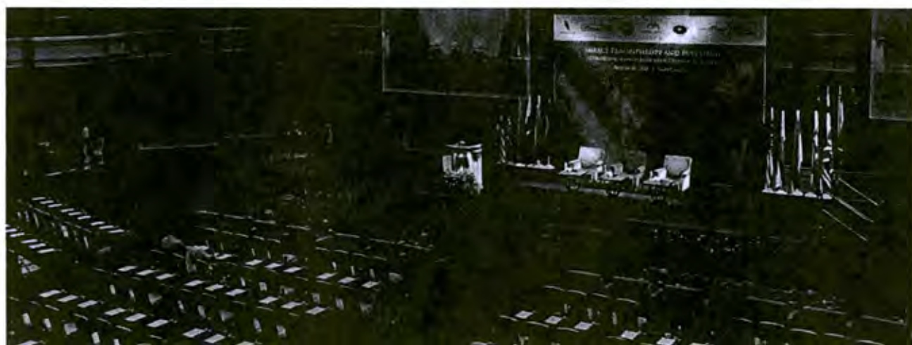
"Impact Philanthropy and Investing" April 26-28, 2012 - Kuala Lumpur, Malaysia